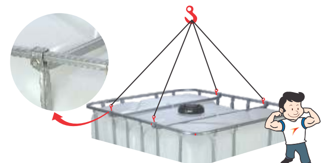
Aligned for Top Performance

Plastic drip pan. Prevents corrosion / rust formation.