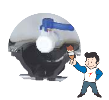
Neat & Rust-free Drip Pan

Clinching position rearranged scientifically on sides. Higher resistance to clinch opening on drop.