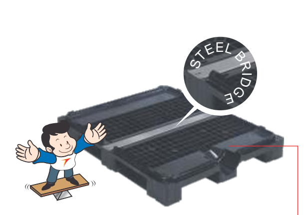
New Plastic Pallet

Top crossbars & respective verticals aligned for a box structure. Upgrades IBC for a top lift capability with reinforced cage. [Available on special request]