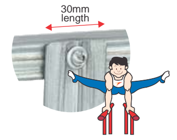
Large Weld Area

All 20 verticals connected to top ring by Anti-vibration Braces (AVB), in addition to welding. Exceptional dynamic stack performance.