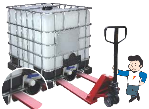
Easy Pallet Truck Access

4- way Composite pallet designed for easy access to pallet trucks.