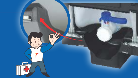
Safety Guard Protectors for cage end near drip area, EHS compliance.