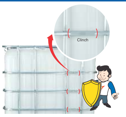
Higher Clinch Performance

Less Bulging Long side verticals scientifically aligned, move forwards centre. Lesser bulging.