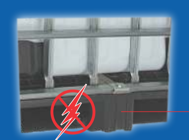
Ground Conductivity Specially bolted for ground earth contact. EHS compliance.

4- way Composite pallet designed for easy access to pallet trucks.