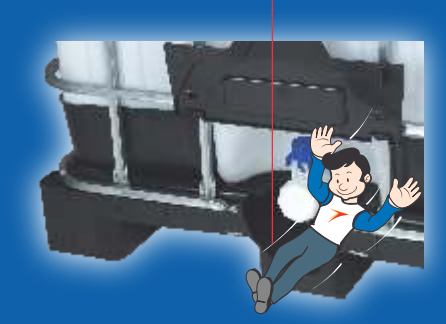
Bigger Dog-house Area Easy valve replacement on used IBC's. Reconditioner's friendly.