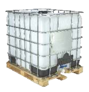
GNX® Bulktainer - WP