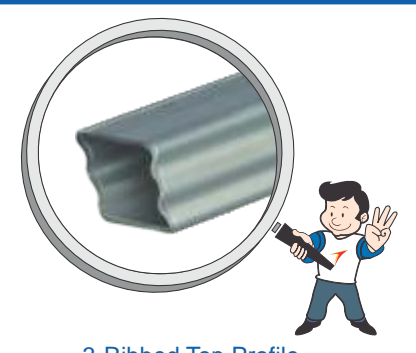
3-Ribbed Top Profile Specially profiled 3-ribbed structure for higher weld contacts.